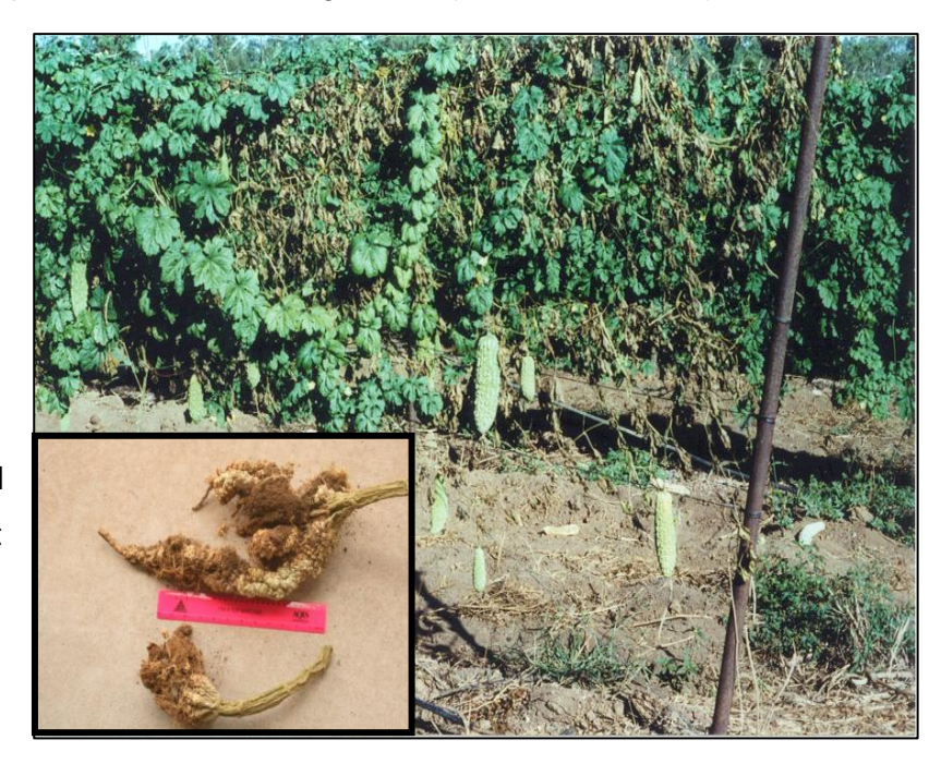
Figure 1: Bitter melon plants showing wilting and drying out symptoms in Meloidogyne incognita infested field. Photo insert bottom left: Heavy galling of bitter melon root system caused by Meloidogyne incognita

RKN infection can be diagnosed by direct examination of the root system for characteristic galls. The galls are outgrowths of the roots themselves and can be differentiated from root nodules by rubbing the galls between fingers. Root nodules come off easily while root-galls do not.